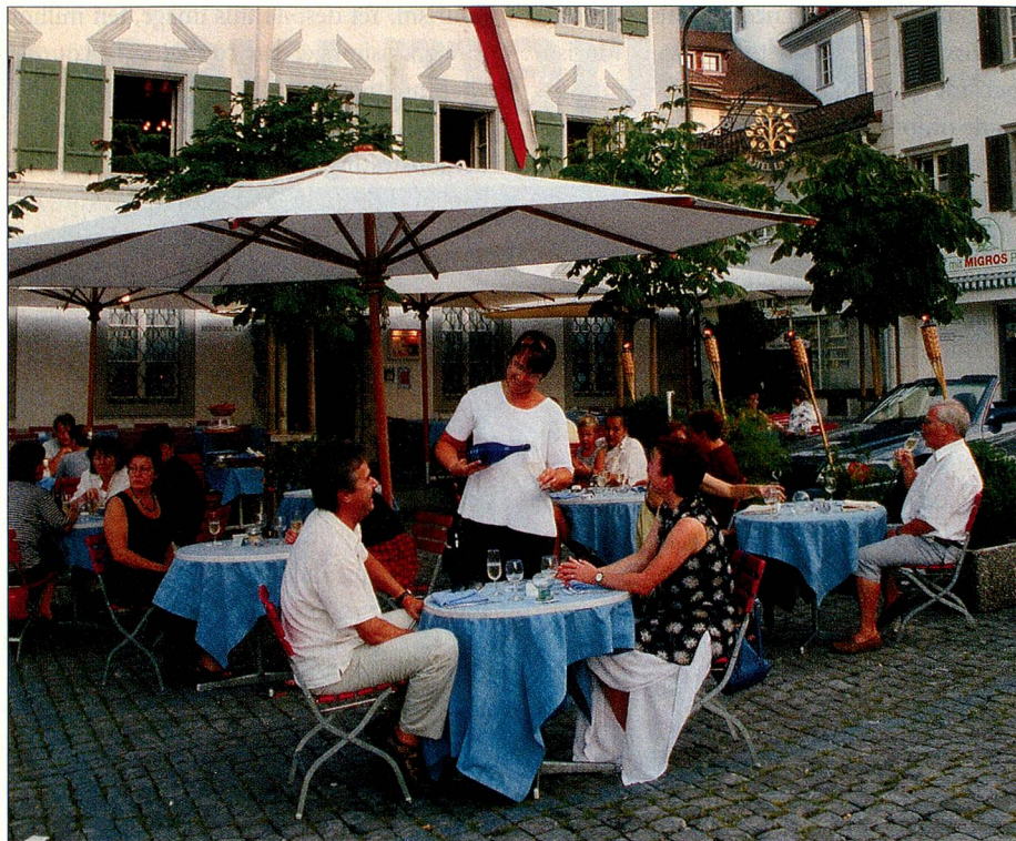
Good food and first-class service are what tourists look for. The photo shows the Restaurant Linde in Stans (NW).

Looking for some hiking tips in the Bernese Oberland? Planning your next cycling tour in the Grisons? How about a summer holiday in the Alps or skiing in the winter? A wellness arrangement, festival or museum visit, city tour? Fancy a long weekend or are you thinking of spending your next long vacation in your home country? Switzerland Tourism’s website at www.myswitzerland.com website has all the answers. The simple, user-friendly system guides you through the latest tourism news and arrangements and allows you to book a hotel or holiday apartment online, from anywhere abroad. RR