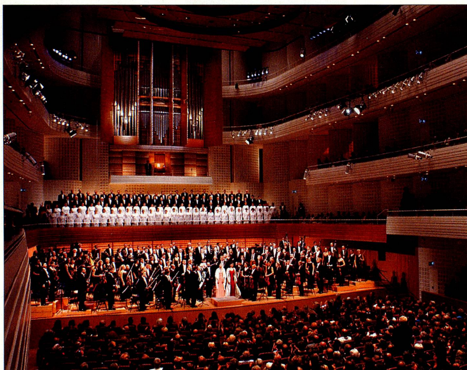
Gem in the summer of festivals: Symphony concert in Lucerne's "Salle blanche".

The open air festival of St.Gallen in Eastern Switzerland is also primarily for visitors who like to camp on site. Row after row of tents are set up on an extensive clearing in the forest. The 29th festival has another attractive programme to offer its 72,000 visitors, including an exclusive appearance by R.E.M., one of the world's most popular rock groups. A newcomer to this year's festival calendar