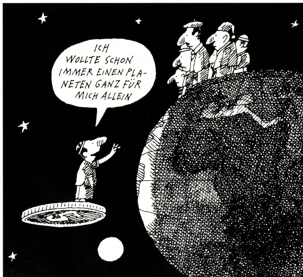
I always wanted to have a planet all to myself.