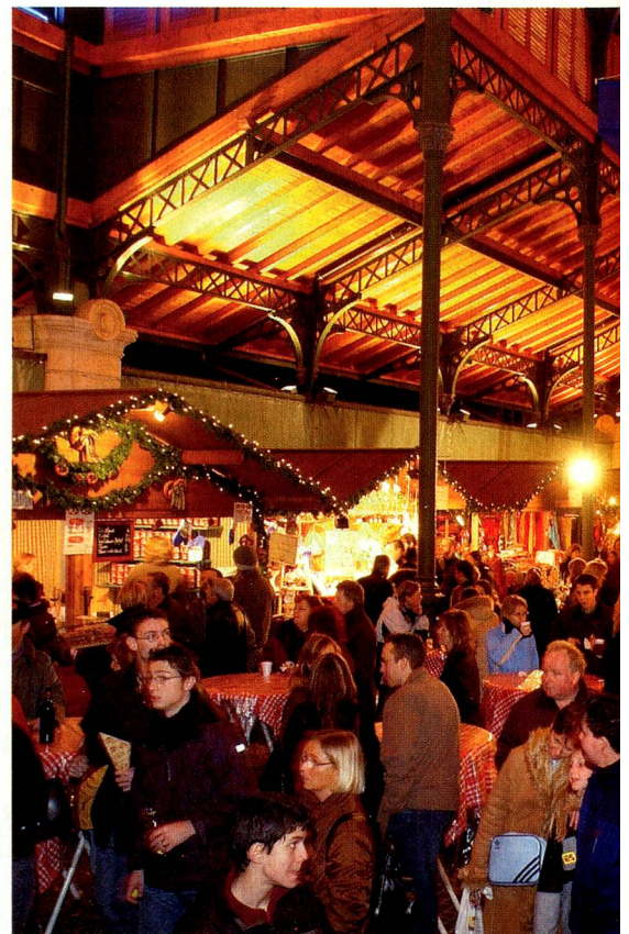
The covered market

The Basle Christmas market, which is in partnership with Montreux, will be held this year for the 26th time, making it one of the oldest Christmas markets in Switzerland. This is due to its close proximity to Alsace and Germany, because it is also partners Colmar, Mulhouse and Freiburg im Breisgau, all of which issue a joint brochure. The 120 stalls and small wooden huts sell handicrafts and agricultural produce from Basle's rural regions and the Black Forest. Several hundreds of thousands of visitors – perhaps as much as a million nowadays – come from far and near to the market on Barfüsserplatz between 29 November and 23 December. "Anyone who happens to be in the city centre stops off here," says Beat Wüthrich, the organising director. Here you will see a baker from Dresden baking his Dresdner Stollen. And like him, lots of craftsmen (including glass blowers)