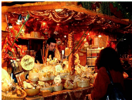
A huge variety on offer

A fire crackles in the hearth of a wooden hut. A centuries-old custom brings back happy memories. Advent is the time when people open their hearts and children with shining eyes can't get enough of fairy tales. And just to make sure that physical pleasures are also catered to, the air is filled with smells and aromas that have almost