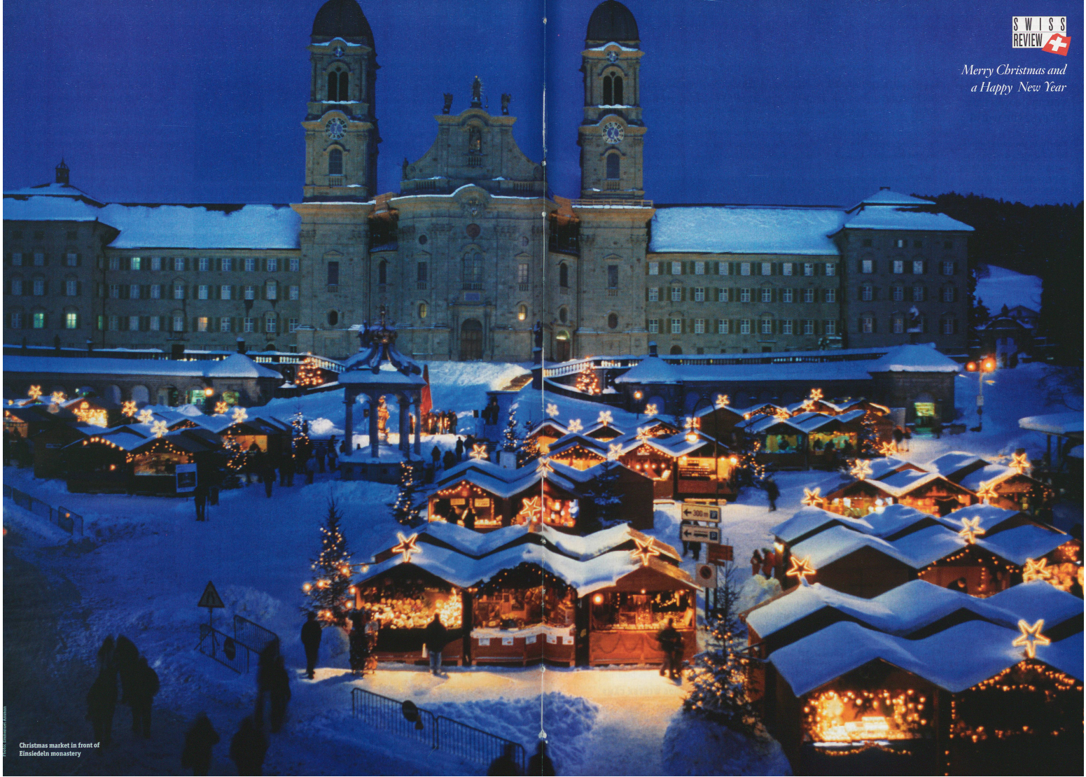
Christmas market in front of Einsiedeln monastery