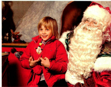
Christmas magic for young and old

been forgotten. Here someone is making candles; there Father Christmas is holding court. Were one to attempt to count the number of Swiss Christmas markets, it would prove a never-ending task. Their popularity has steadily grown over the past ten years. Small or large, authentic or less so, they have conquered the hearts of the Swiss. With their rows of wooden huts and stands, they breathe life into winter, bringing a brisk trade to streets that were formerly in virtual hibernation. Here you can buy whatever takes your fancy, discover novel ideas and share impressions. Whistle-stop tourists have given way to quiet, contemplative visitors who take the time to absorb this magical landscape. The enchantment of these markets owes much to the simple wares fashioned from wood or other virtually forgotten materials.