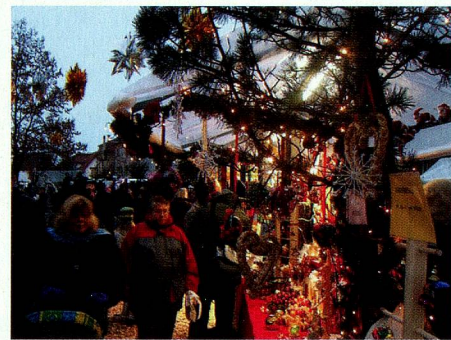
Stans, village centre

From 1 to 4 December the historic city of Willisau/LU will be running its 9th Christmas