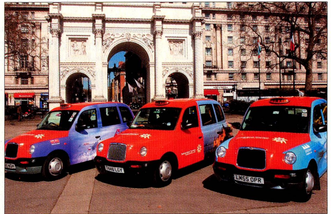
Seen outside Marble Arch in London's West End, three of the 21 taxis that are spearheading the Swiss Travel Centre's aggressive campaign to maximise the number of Brits taking holidays in Switzerland

Switzerland Tourism is ramping up its marketing to boost even further the appeal