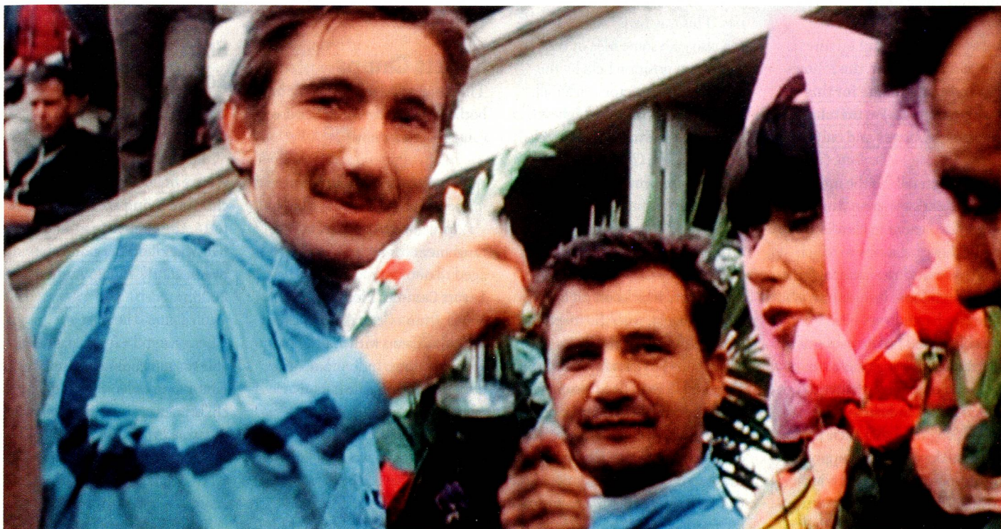
Joe Siffert with friends after a race in 1967, and (below) on the film poster.