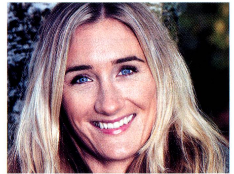
Tanja Frieden, Olympic boardercross champion