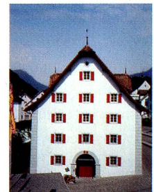
Forum of Swiss History, Schwyz