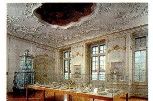
"Zur Meisen" Guild House, Zurich