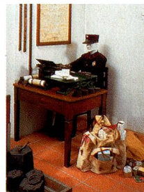
Customs Museum, Gandria