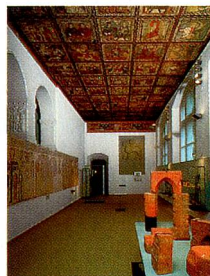
Swiss National Museum, Zurich