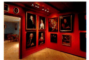
Bäregasse Museum, Zurich

The Swiss Confederation not only supports the eight institutions that make up the Musée Suisse group, but owns a total of 15 museums itself. The state also supports another 70 museums, for which no fewer than five departments and eleven federal offices are responsible. Because there is strictly speaking no museum policy, parliament has commissioned the Federal Council to draw up a binding strategy by 2007.