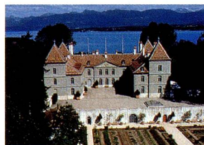
Château de Prangins

The eight museums of the Musée Suisse group are a national and international window on the culture and history of life in Switzerland. As museums for cultural history, their permanent and temporary exhibitions and special events address trends and developments in what is now Switzerland, from ancient and early history to the present day. In so doing, they are bound by a broad understanding of culture that blends history, applied and fine arts as well as historical lifestyles into an overview of cultural history.