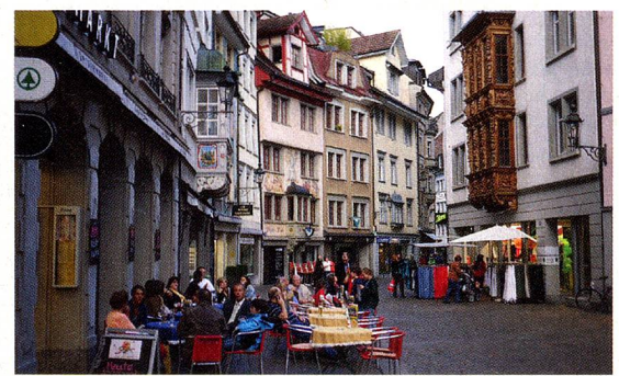
St. Gallen, host city of this year's OSA Congress 2010

We invite all Sunshine Coast Swiss, their families and friends to join us for our fun events, to enjoy good company, catch up with old mates and make new friends! Please check our website for more details.