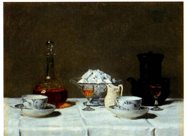
«Tee und Cognac». In his still life paintings, Albert Anker draws inspiration from 200 years ago and the master Jean-Baptiste Siméon Chardin.