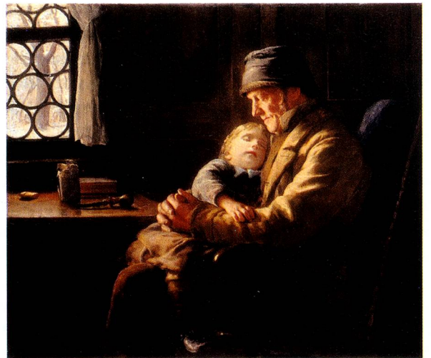
«Grossvater mit schlafender Enkelin». Critics say Anker only painted old people and children. They were the only models who had time to sit for him instead of working the land.