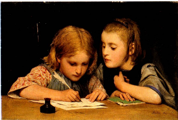
«Schreibunterricht II». Learning to write is not an easy task and certainly no idyll.