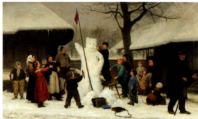
«Der Schneebär». The artist knows the Bernese well. They don't build snowmen, but instead "snow bears", their heraldic animal.