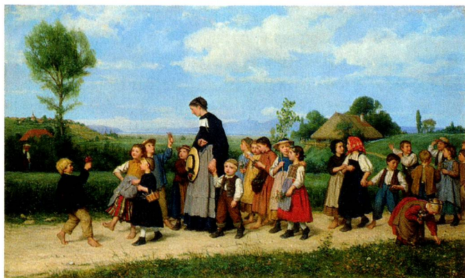
«Der Schulspaziergang». In 1872, Albert Anker, himself a member of the School Supervisory Board, called for mandatory co-educational schooling.