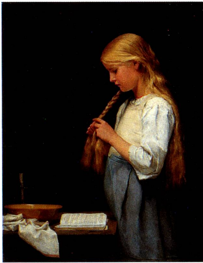
«Mädchen, die Haare flechtend». Anker gives equal attention to the book, cloth and plait: not fastidious realism but an inclination towards the everyday things in life.

This made his success even more significant. Anker was able to exhibit at the much-coveted "Salon", whereas Manet, Degas and Monet were rejected. He lived in Paris in the winter months, he was well versed in topics ranging from Plato to Darwin and he spoke French with his friends. In the summer, he lived and painted in his grandparents' house in Ins, popular and revered. His genre paintings were in keeping with contemporary tastes. In the emerging federal state, Anker-