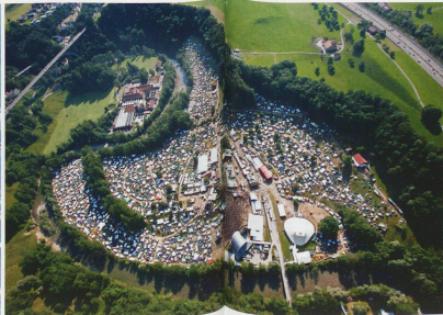
Sittertobel, OpenAir St. Gallen