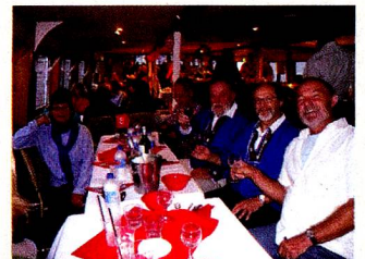
Yodelers @ Harbor Cruise