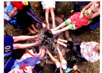
Upper Colo River Camping weekend

We are a group of Swiss/Australian, Swiss/International families that get together every first Sunday of the month from 11am.