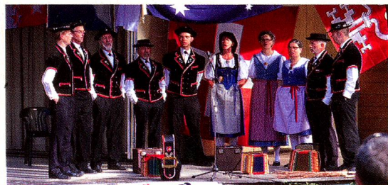
Baerg-Roeseli @ 1.August