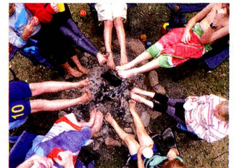
Upper Colo River Camping weekend

We are a group of Swiss/Australian, Swiss/International families that get together every first Sunday of the month from 11am.