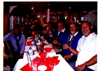
Yodellers @ Harbor Cruise