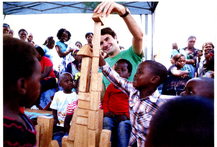
14000 children in South Africa alone benefit from the Federer Foundation.