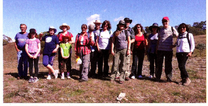
Members of the Canberra Swiss Club before the walk to London bridge at the upper end of Googong dam

22/6 Fondue, North Perth Bolwling Club (please check our website for updates)