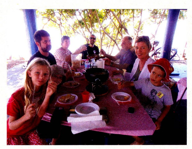
Swiss Fondue at the Beach. Fraser Coast Swiss Group, QLD

phone +41 44 466 9000 fax +41 44 461 9010 www.swiss-moving-service.ch info@swiss-moving-service.ch