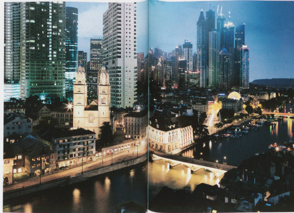
A scenario presented by critics of immigration for the city of Zurich

However, the problems mentioned cannot simply be dismissed. The SVP is far from the only party with immigration on its agenda. The Social Democrats are also taking notice of people's anxieties. They presented a policy paper on immigration in 2012. However, unlike the SVP, they are not seeking the immediate revocation of the free movement of persons. Their solution is to bulk up the accompanying measures to counter wage pressure and high rental costs. They regard "misguided con-