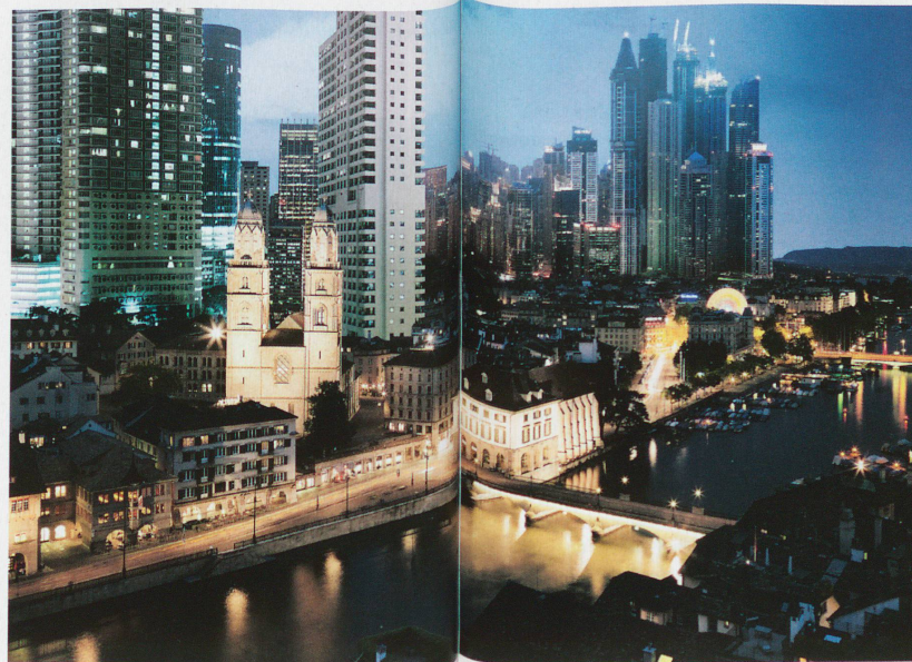
A scenario presented by critics of immigration for the city of Zurich

However, the problems mentioned cannot simply be dismissed. The SVP is far from the only party with immigration on its agenda. The Social Democrats are also taking notice of people's anxieties. They presented a policy paper on immigration in 2012. However, unlike the SVP, they are not seeking the immediate revocation of the free movement of persons. Their solution is to bulk up the accompanying measures to counter wage pressure and high rental costs. They regard "misguided con-