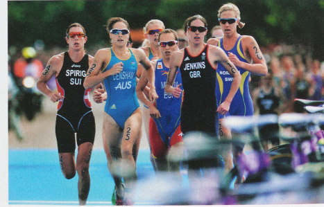
Triathletes in action: swimming, cycling, running