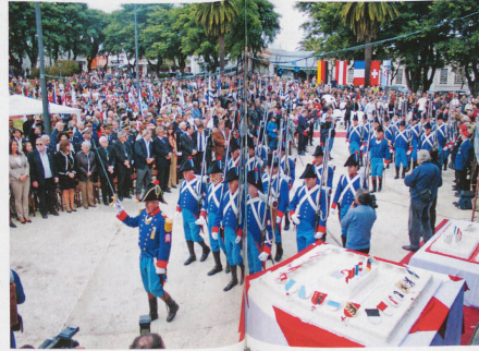
150 years of Nueva Helvecia in Uruguay was celebrated with military parades in 2012. Around 1,000 Swiss abroad currently live in this South American country