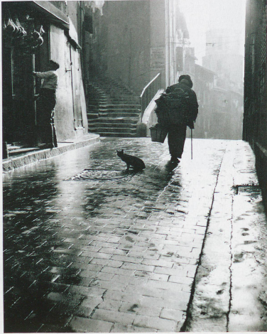
An alleyway in Marseille in the early morning

staged at two museums, uses individual stories and biographies to show what emigration is all about and how emigrants to all parts of the world attempt to integrate a bit of their old homeland into their new one. "Appenzeller Auswanderung - Von Not und Freiheit" exhibition at the Volkskunde-Museum in Stein and at the Brauchtummuseum in Urnäsch. Duration: until 27 October in Stein, until 13 January 2014 in Urnäsch. www.appenzeller-museum-stein.ch www.museum-urnaesch.ch .