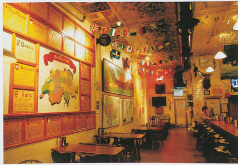
"The Original Baumgartner", the Swiss tavern with cheese shop has existed in Wisconsin since 1931