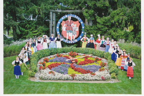
Many traditions have continued for generations in New Glarus, founded in 1845