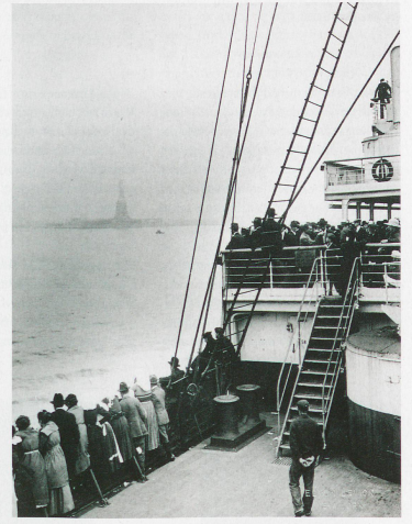
Emigrants aboard a ship approaching New York, taken in 1915 by Edwin Levick