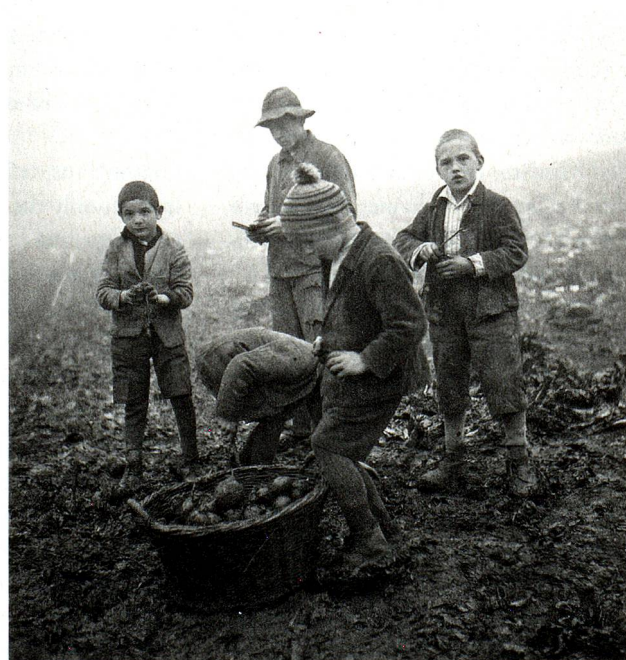
Photographs of contract children taken by Paul Senn in the 1940s, on display at the “Verdingkinder reden – Enfances volées” exhibition being held at various local