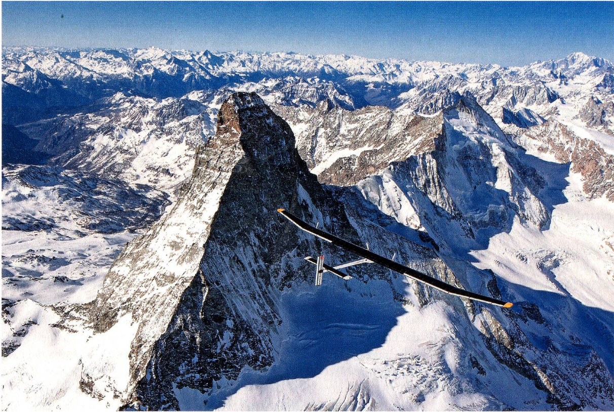
The HB-SIA on a flight above Zermatt