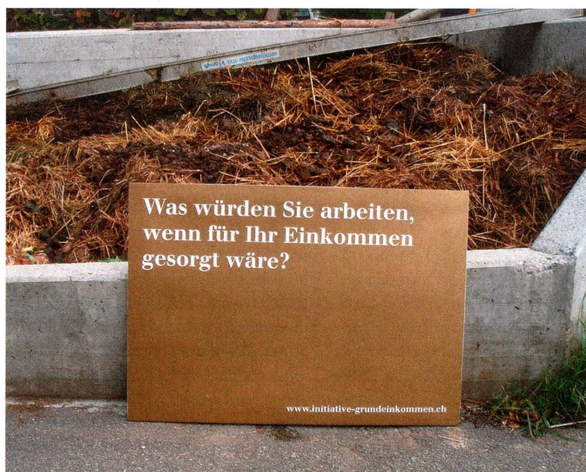
“Would you work if your income was provided anyway?” There is no easy answer.

A celebration is to be held in Berne on 4 October 2013 – its organisers are inviting people to witness an “historic event”. They then plan to submit the 100,000-plus signatures supporting their popular initiative for an unconditional basic income to the Federal Chancellery. This issue is not just topical in Switzerland as signatures are also currently being collected in the EU for an EU citizens’ initiative (not comparable with popular initiatives in Switzerland). This is entitled: “Unconditional Basic Income (UBI) – Exploring a pathway towards emancipatory welfare conditions in the EU.”