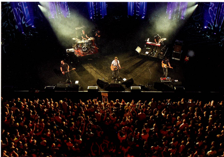
Performing at the Stravinski Auditorium in Montreux