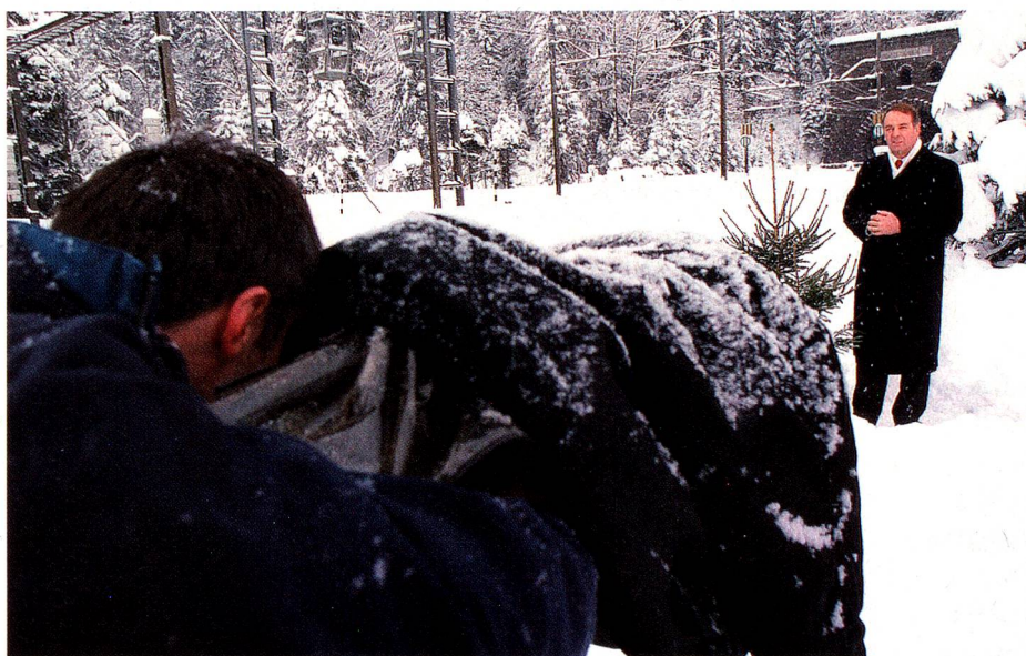
New Year's address as Swiss President in front of the Lötschberg tunnel in Kandersteg in December 1999