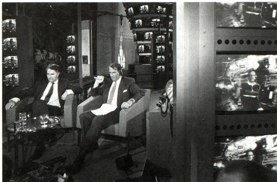
During the direct link-up with Claude Nicollier in the Atlantis space shuttle in August 1992

Swisscor is Ogi's social legacy from his Federal Council days. The "Freude herrscht" (Joy Abounds) foundation, which he also founded, combines social and sporting aspects. This institution aims to encourage children to participate in sport and exercise.