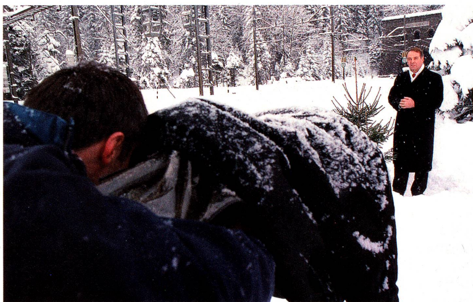
New Year's address as Swiss President in front of the Lötschberg tunnel in Kandersteg in December 1999