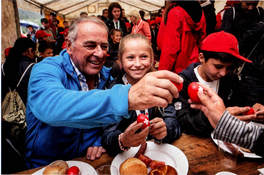
Adolf Ogi with children from Eastern Europe who receive medical care thanks to the Swisscor foundation

You sometimes have to observe things at a sufficient distance. For example, in summer 1992, NASA's space shuttle Atlantis sped around Earth 127 times. Claude Nicollier, Switzerland's first and only astronaut to date, was aboard. It was a big step for Nicollier and a giant step for Swiss space travel. The shuttle hurtled around the planet at 30,000 kilometres an hour. It is just that what Nicollier did in the freezing depths of outer space left no mark on Switzerland's collective consciousness. In contrast, the words that Federal Councillor Adolf Ogi shouted to Nicollier through the ether on 7 August 1992 via a sophisticated radio link remain etched in the mind: "Freude herrscht, Monsieur Nicollier!" (Joy abounds, Monsieur Nicollier!) – the words of congratulation immediately became a turn of phrase. Quoted thousands of times, it has become part of Swiss German vocabulary. Joy is even more wonderful when it not only exists but is ubiquitous, when "joy abounds".