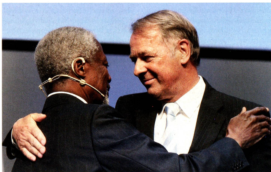
Embracing former UN Secretary-General and friend Kofi Annan at the WEF in Davos in 2007