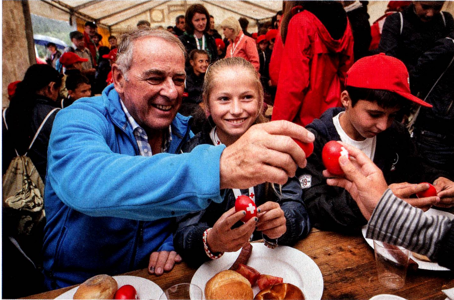
Adolf Ogi with children from Eastern Europe who receive medical care thanks to the Swisscor foundation

You sometimes have to observe things at a sufficient distance. For example, in summer 1992, NASA's space shuttle Atlantis sped around Earth 127 times. Claude Nicollier, Switzerland's first and only astronaut to date, was aboard. It was a big step for Nicollier and a giant step for Swiss space travel. The shuttle hurtled around the planet at 30,000 kilometres an hour. It is just that what Nicollier did in the freezing depths of outer space left no mark on Switzerland's collective consciousness. In contrast, the words that Federal Councillor Adolf Ogi shouted to Nicollier through the ether on 7 August 1992 via a sophisticated radio link remain etched in the mind: "Freude herrscht, Monsieur Nicollier!" (Joy abounds, Monsieur Nicollier!) – the words of congratulation immediately became a turn of phrase. Quoted thousands of times, it has become part of Swiss German vocabulary. Joy is even more wonderful when it not only exists but is ubiquitous, when "joy abounds".