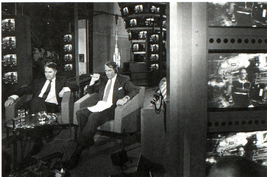
During the direct link-up with Claude Nicollier in the Atlantis space shuttle in August 1992

Swisscor is Ogi's social legacy from his Federal Council days. The "Freude herrscht" (Joy Abounds) foundation, which he also founded, combines social and sporting aspects. This institution aims to encourage children to participate in sport and exercise.