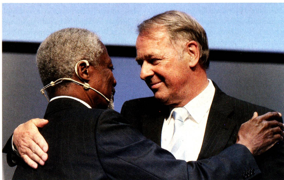
Embracing former UN Secretary-General and friend Kofi Annan at the WEF in Davos in 2007