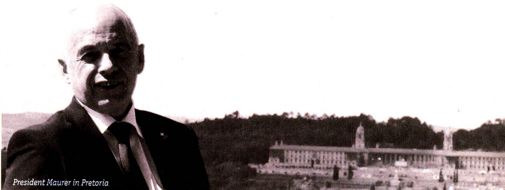
President Maurer in Pretoria