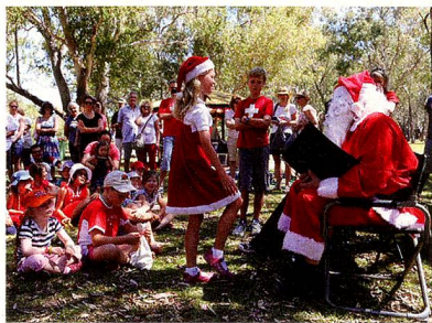
Samichlaus in WA

The year ended with Santa Clause visiting us at Perry Lakes on December 7, talking personally to each child and handing out the traditional "Samichlaus" bags with nuts and goodies. 2015 will start with the AGM on Feb 22.