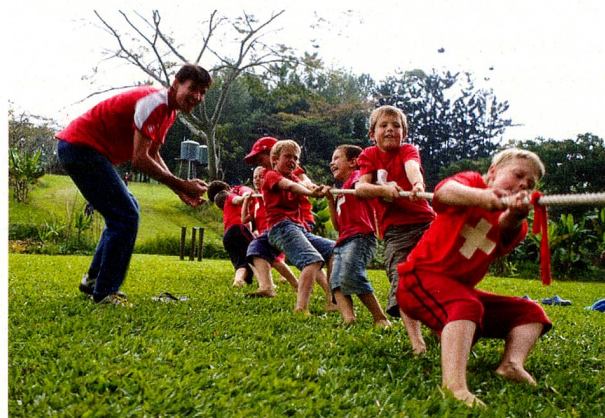
"Pulling on the same rope together" Swiss Community PNG

See: www.eda.admin.ch/countries/australia/en/home/news/open-job-vacancies.html