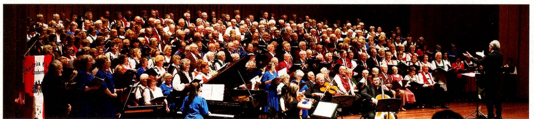
Swiss Yodlers of Sydney taking part at the triannual German Sangerfest

Swiss Play Group impressions from recent trips to the zoo and the spring craft event.