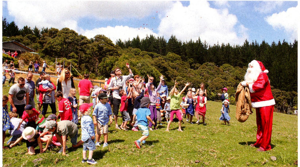
Samichlaus function in New Zealand

Since then, second and third generation descendants have joined the club. We also have many young families, often composed of a Swiss parent