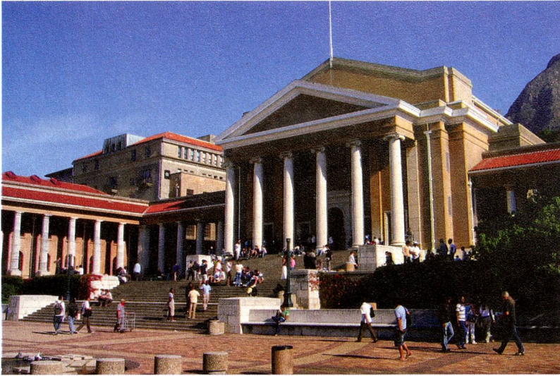
A strong partnership: The University of Cape Town and the Swiss Federal Institute of Technology.

wish to contact us, then please do so by writing to aso@hbosch.com . The Ausland-schweizer Congress will take place from 15 – 16 August in Geneva. More informations on the ASO website or on swisscommunity.org .