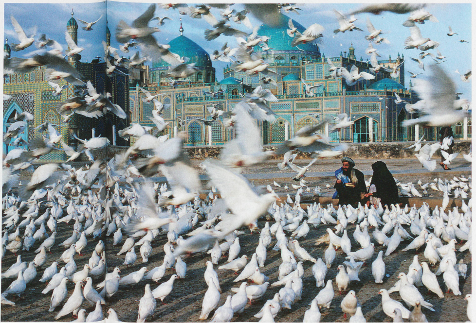
Afghanistan in 1991: the Blue Mosque in Mazar-i-Sharif