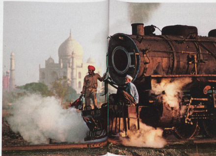
India in 1983: a train in front of the Taj Mahal in Agra in the federal state of Uttar Pradesh