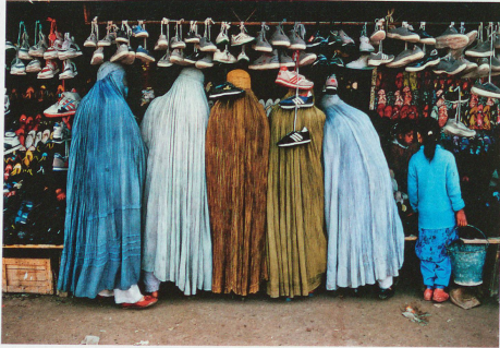
Afghanistan in 1992: women at a shoe seller's in Kabul