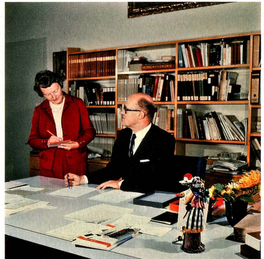
Director of the Swiss National Museum in Zurich with his secretary, taken around 1975