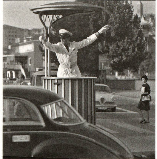
Traffic policeman in Zurich, taken around 1960