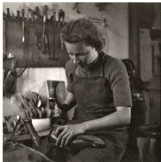
Switzerland's first female shoemaker, taken in 1944 in Lachen