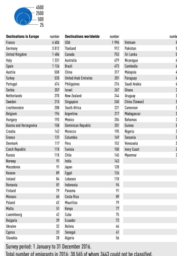
Please note: The depiction of borders and the use of names and titles on this map does not mean that Switzerland officially endorses or recognizes them. Survey period: 1 January to 31 December 2016. Total number of emigrants in 2016: 30,565 of whom 3443 could not be classified.

Number of Swiss emigrants per destination