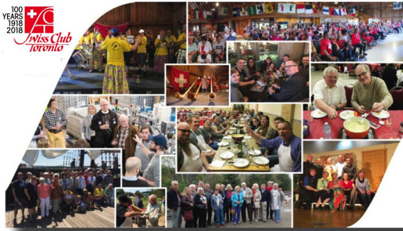
Toronto Swiss Club (above), Matterhorn Swiss Club (below)