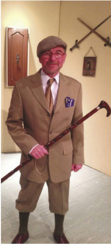
Above: Two scenes from "Miss Sophie's Erbe" (Miss Sophie's Inheritance)