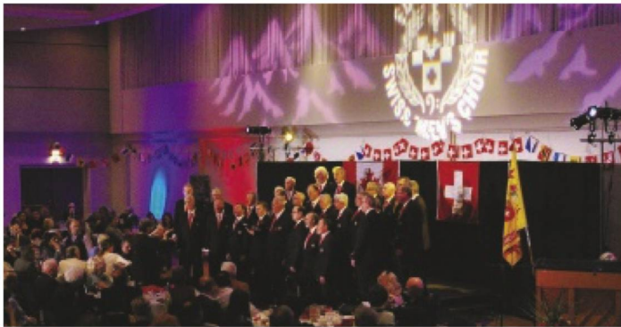
The Edmonton Swiss Men's Choir at Winzerfest 2018

On November 10, 2018, the Edmonton Swiss Men's Choir hosted another successful Winzerfest at St. Basil's Cultural Centre in Edmonton. 2018's theme "Celebrating Friends, Food and Song" truly resonated with the audience. The choir delivered one of its stronger performances, supported by the Swiss Dance Club Alpenroesli from Calgary - a memorable evening for all!