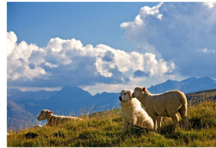
A Maremmano-Abruzzese sheepdog protecting its flock on the Grisons mountain pastures.

It is also permitted to kill wolves if the same wolf is shown to have been responsible for too many livestock losses; the red line is normally