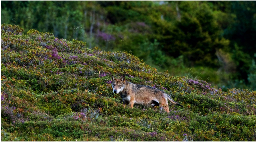
Nature photographer Peter A. Dettling took this photo of a feral wolf in Surselva in August 2006. It was one of the first such pictures taken without the help of a photo trap.