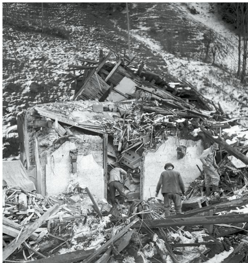
Debris in the village after the 1947 explosions – nine people died and many houses were destroyed.