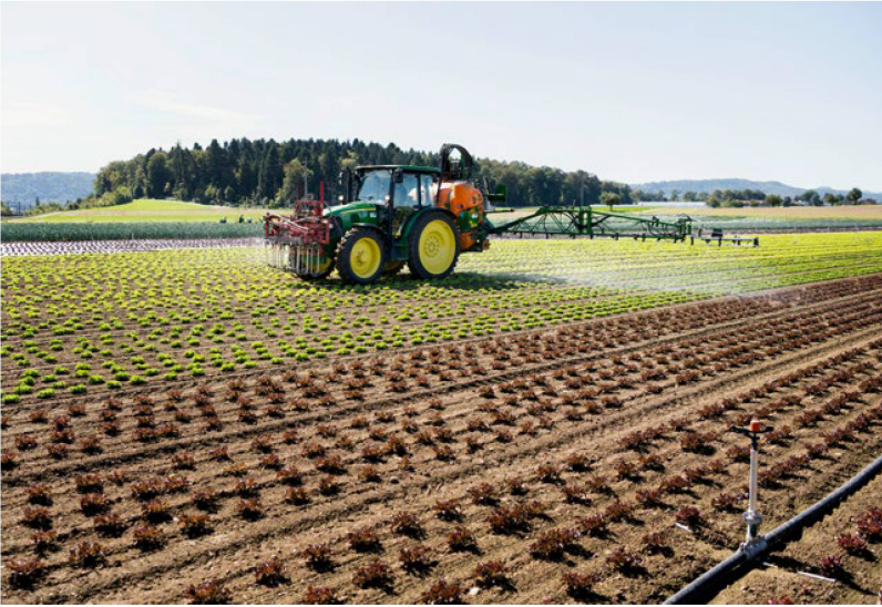
Both initiatives specifically take aim at agriculture and its use of pesticides. Crop production would fall by at least 30 per cent without pesticides, says the Swiss Farmers' Union.

mitted threshold. One way to reduce the chlorothalonil is to dilute it with uncontaminated water, while a water cooperative in the Bernese Seeland region aims to eliminate it using an innovative filter. This only goes part of the way towards solving this serious problem, says Würsten, because it works against the principle that groundwater in Switzerland should not undergo complex treatment processes.