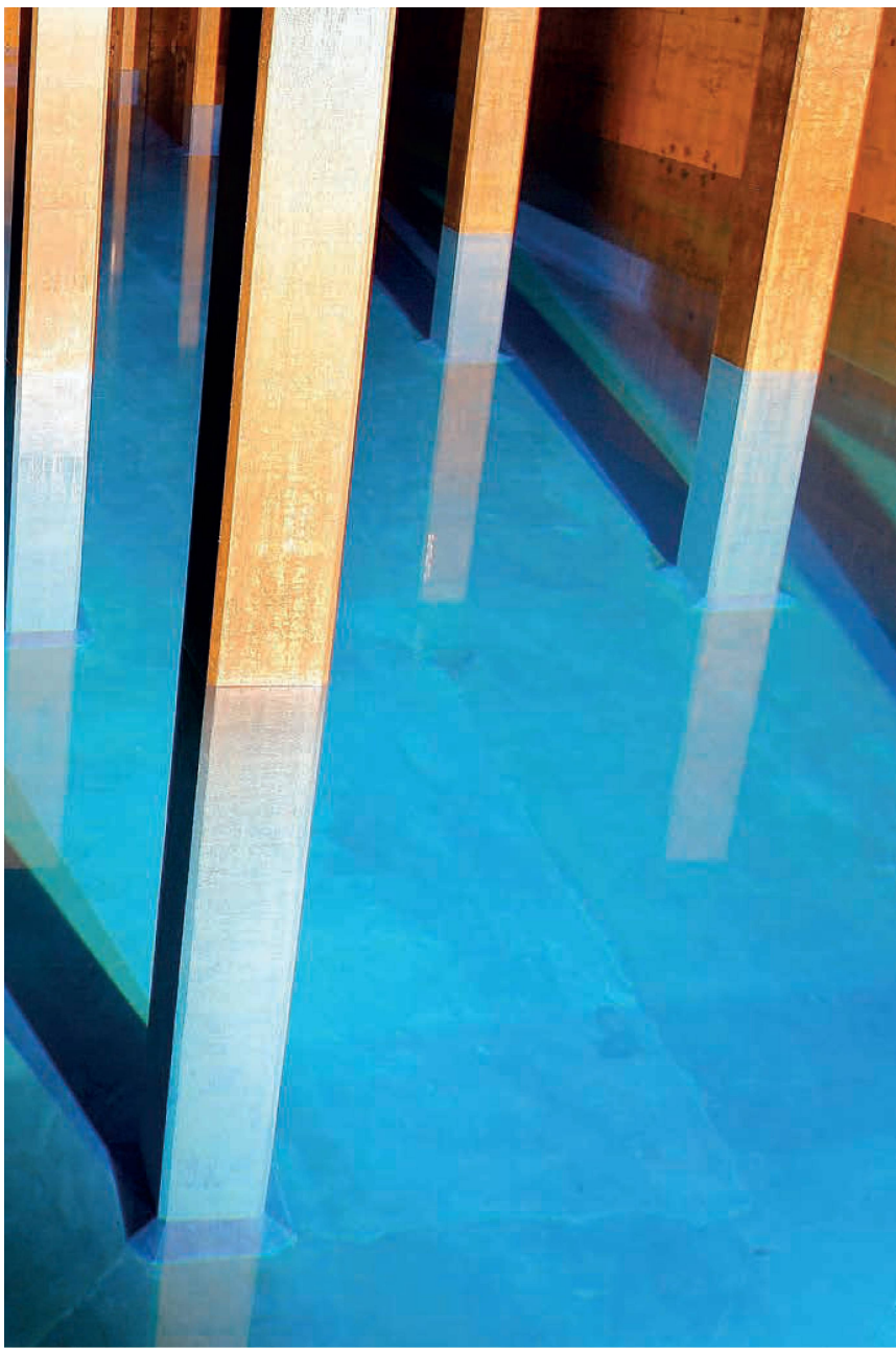
A subterranean aquatic temple – the Lyren drinking water reservoir in Zurich-Altstetten.