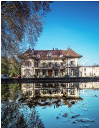
The Eichberg feudal country estate of the noble Bernese von Fischer family

As if preordained by Mother Nature some 14,000 years ago, there is something unique about Uetendorf's geographical whereabouts. When the Aare Glacier slowly receded at the end of the last Ice Age, it left behind a landscape of small hills that today look like natural viewing platforms offering a view over Uetendorf and across the levels of the Aare Valley to Thun. Look