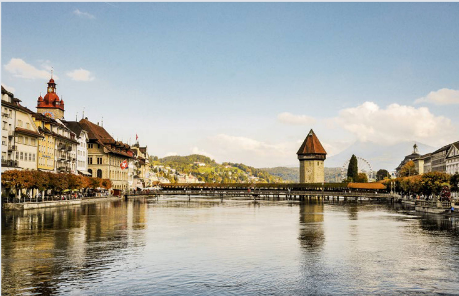
The Chapel Bridge and its water tower – one of the most iconic sights in Lucerne.

The 100th Congress of the Swiss Abroad will take place in the magnificent setting of Lucerne, against the backdrop of Lake Lucerne and the majestic Alpine peaks. And that's not all – we will be celebrating three anniversaries, and enjoying an interesting exchange of ideas.