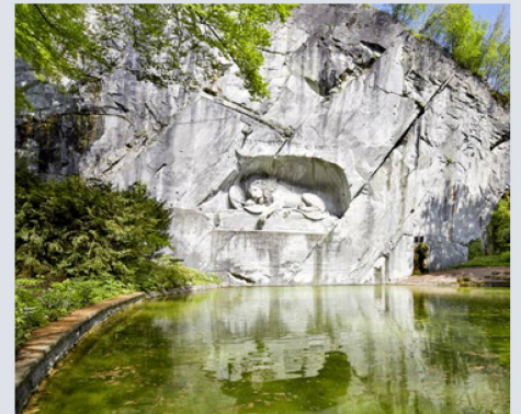
The Lion Monument commemorates the Swiss Guards who fell during the Storming of the Tuileries in Paris in 1792.

The 100th Congress of the Swiss Abroad will be a memorable occasion. It will address the past, present and future of the Swiss diaspora and will enable us to celebrate this