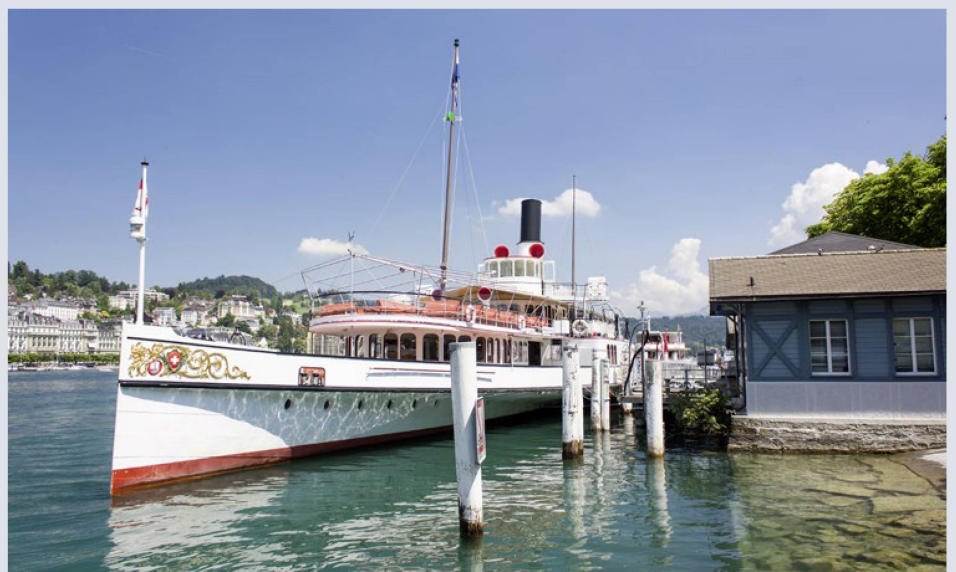
Boats are a common sight in Lucerne – vintage paddle steamer “Uri”, moored at Bahnhofquai.