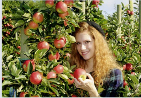
An enormous range characterizes the 245 professions for which apprenticeships are offered in Switzerland – from arboriculturist ...

An apprenticeship lasts three or four years, depending on the profession. Those who complete their apprenticeship and gain the Federal VET Diploma are well prepared for