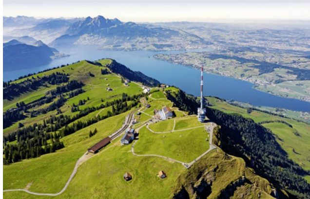
View from the slopes of Mount Pilatus down to Lake Lucerne and the city of Lucerne.

connection to our homeland which is reflected in the spirit of unity among the Swiss wherever they may live.