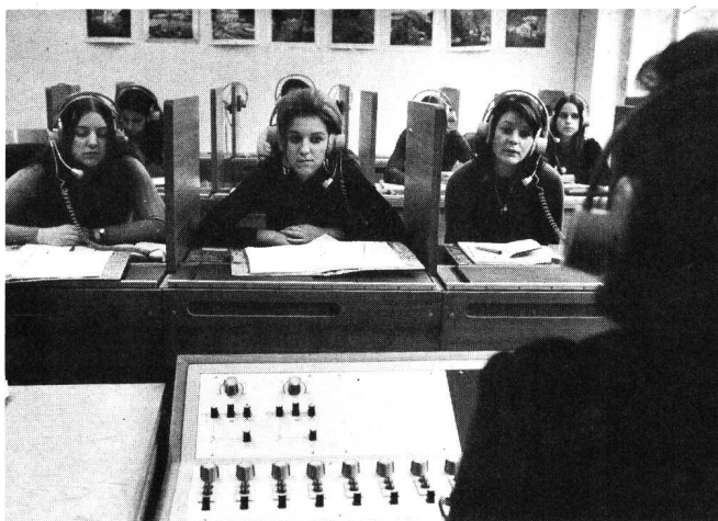
A language laboratory

An enquiry with the Telephone Regions has shown that language laboratories are popular and results excellent. After a very short time the telephone and telegraph opera-