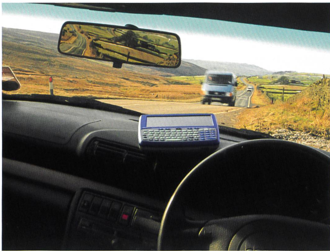
Figure 2. When GPRS and 3G/UMTS networks appear, one feature will be an "always on" capability.

At a time when future networks suggest available capacity will explode and herald multimedia applications, "Three X Communication" believes it is possible to drive down the cost of wireless communications across a range of markets – not just the traditional sectors of logistics, transport and field service. There is a marked trend among financial services, for instance, to access information via handheld devices from a central repository across wireless communications rather than supporting individual high-performance laptops. The cost of picking up a relevant piece of information over a mobile GSM data network via an optimised mobile data solution is weighed against a conventional remote link into the corporate network.