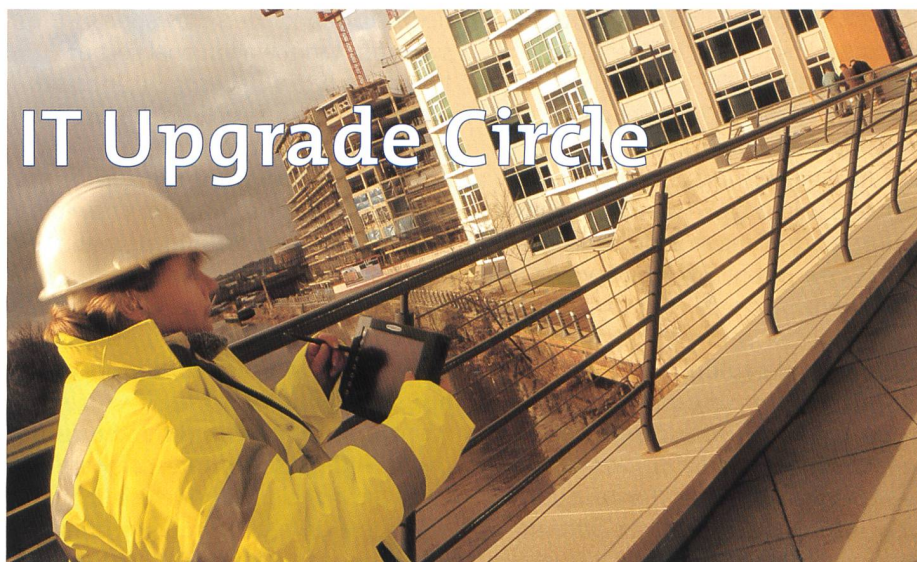
Figure 1. Enterprises with field service engineers know well that the efficiency of communications has a direct bearing on bottom line profits.

A year or so ago, the vision of what 3G/UMTS (Universal Mobile Telecommunications System) might one day deliver drove the industry into a veritable fever, fuelled by the huge price tags put on 3G licences to run one of these futuristic networks. Initial talk was of 2 Mbit/s to the handset and the emergence of a plethora of advanced applications, each more desirable than the next, to revolutionise our working and domestic lives. The trouble begins now that GPRS (2.5G,