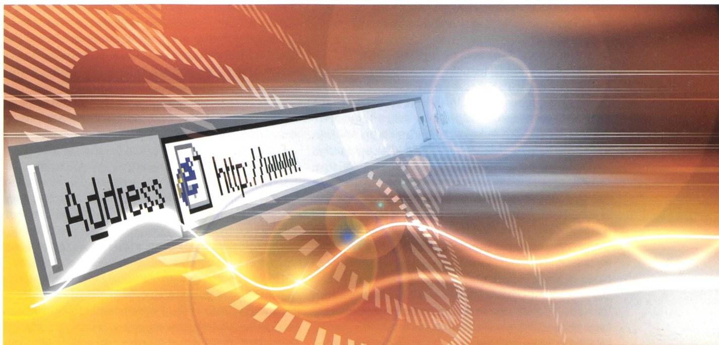
Fig. 1. To be connected to the Internet, any computer or other device must have a unique IP address assigned to it.

The Internet Protocol (IP) address system is part of the underlying infrastructure of the Internet. To be connected to the Internet, any computer or other device must have a unique IP address assigned to it.