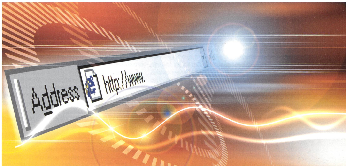
Fig. 1. To be connected to the Internet, any computer or other device must have a unique IP address assigned to it.

The Internet Protocol (IP) address system is part of the underlying infrastructure of the Internet. To be connected to the Internet, any computer or other device must have a unique IP address assigned to it.