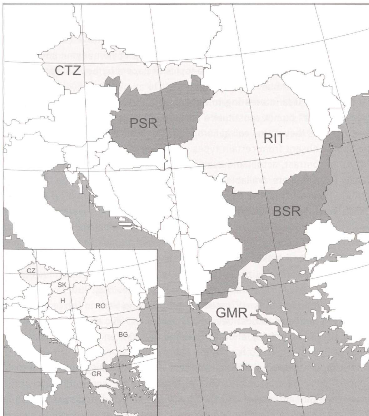
Map 1. Transect divided into natural territories according to the distribution patterns of wolf spiders (abbreviations in main text). Inset: Countries lying on the selected transect.

on material readily collected in pitfall traps (e.g. Tretzel 1952). In 1970–1982, 41.8% of all spider species collected in Bohemia by applying this collecting method were species of the family Lycosidae (Buchar 1995). The easy way of collecting lycosid spiders, however, did not invariably result in unequivocal development of knowledge. Often there arose numerous synonyms as well as homonyms. As late as in the second half of the 20 th century, there appeared modern manuals permitting an integral species identification. They pertained, e.g., to the genera Arctosa (Lugetti & Tongiorgi 1965, 1966), Alopecosa (Lugetti & Tongiorgi 1969), Pardosa (Tongiorgi 1966a,b, Holm & Kronestedt 1970), and Trochosa (Engelhardt 1964). Subsequent papers differentiated hitherto