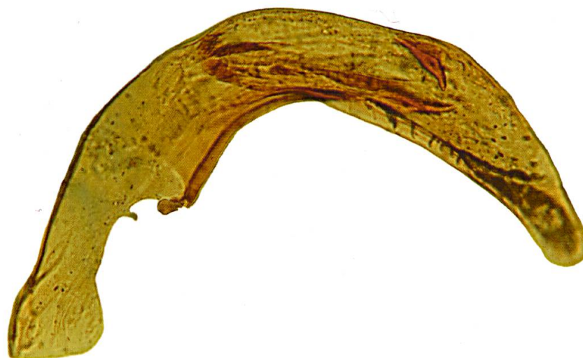
Fig. 5a, b: Asioreicheia chinensis (BULIRSCH, MAGRINI & JIA, 2013) a: Median lobe of aedeagus, ventral view; b: apical part of median lobe, ventral view.