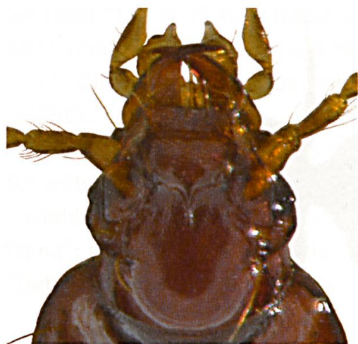
Fig. 2: Asioreicheia guenardi sp. nov., holotype, male, head with mouthparts, dorsal view.

Elytra: Moderately convex on disc, distinctly convex in basal third (lateral view). Outline regularly long-oval, maximum width at middle, margined from pedunculus to apex; margin serrate up to apical third, teeth of serration sharp basally, becoming indistinct apically; base nearly straight, with fine and smooth reflexed margin; humeral angle visible, obtuse; lateral channel broad from level of humerus to apex, narrow at middle, with fold-like carina near apex crossing lateral channel, with broad setigerous tubercles; setae robust, long. Suture at base somewhat impressed. Basal granula absent; basal setigerous puncture with distinct tubercle, situated in projected extension of first interval. No scutellar stria. Striae 1–3 consisting of partly connected punctures, 1–5 reaching base but not up to basal declivity, all becoming less impressed towards apex and laterally. First interval slightly to moderately convex, others flattened. Interval 3 with 10–12 and interval 5 with 7–8 fine setigerous punctures, located with nearly equal distance to each other but with irregular distance to striae, setae pili-like, short, fine, upright.