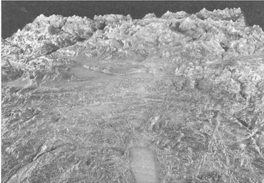
Figure 4: Relief-Map of Lake of Four Cantons, by Franz Ludwig Pfiffer von Wyher (1716–1802)

with the pleasure of domination.” 36 Wordsworth makes a similar observation, claiming that by overlooking the scenery from a “little platform,” which reproduces the effect both of Picturesque tourism and of prospect poetry, the spectator receives aesthetic pleasure, “exquisite delight to the imagination,” but also, and more importantly, utilitarian pleasure by apprehending all the landscape “at once.” 37