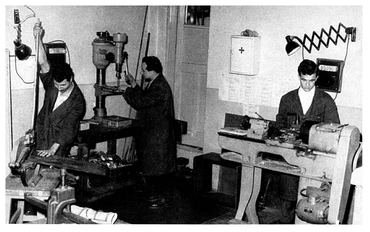
YUGOSLAVIA The artificial limb workshop in Sarajevo.