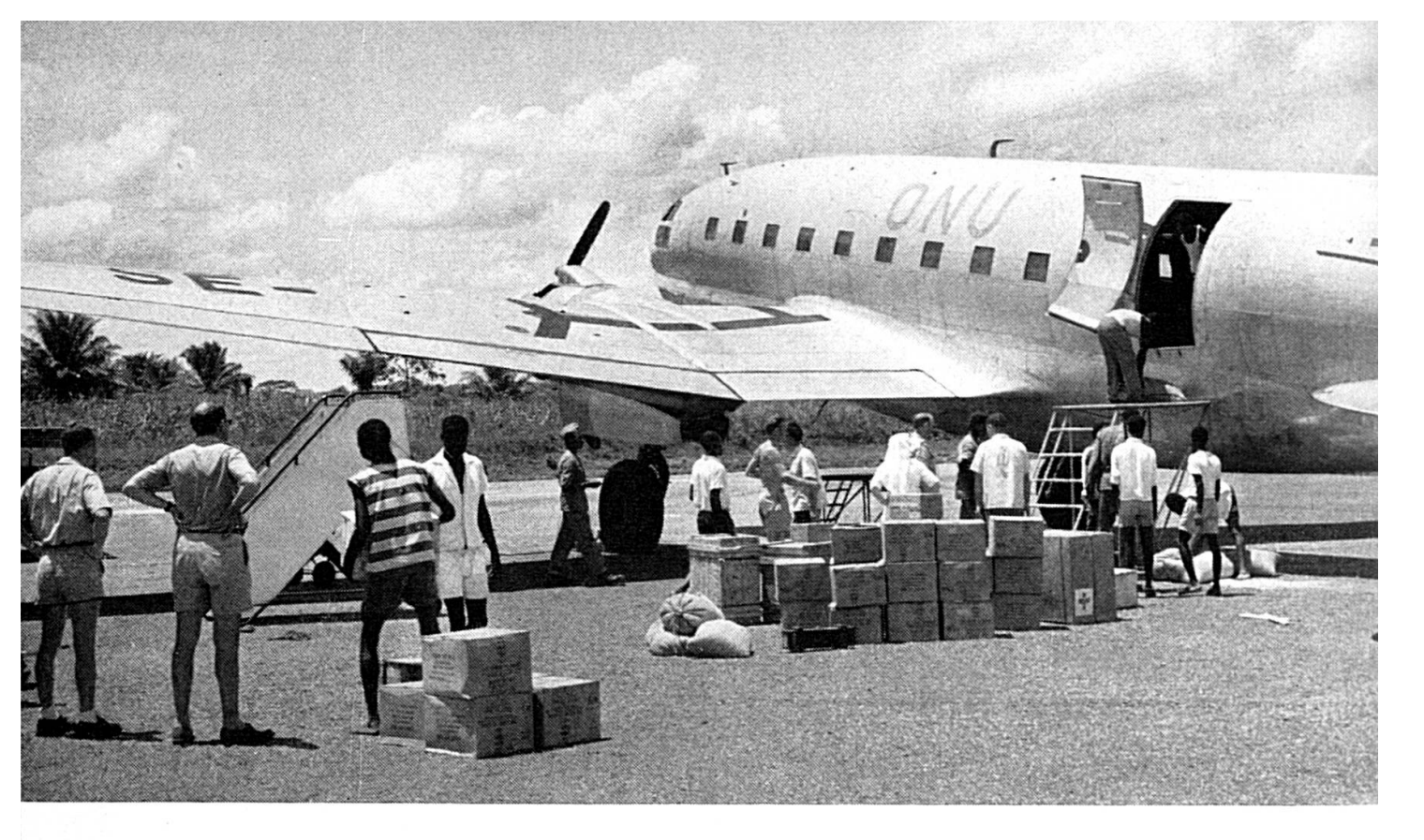
CONGO Foodstuffs and medical supplies for the hospital at Gemena being unloaded from a United Nations aircraft placed at the disposal of the ICRC and accompanied by a delegate.