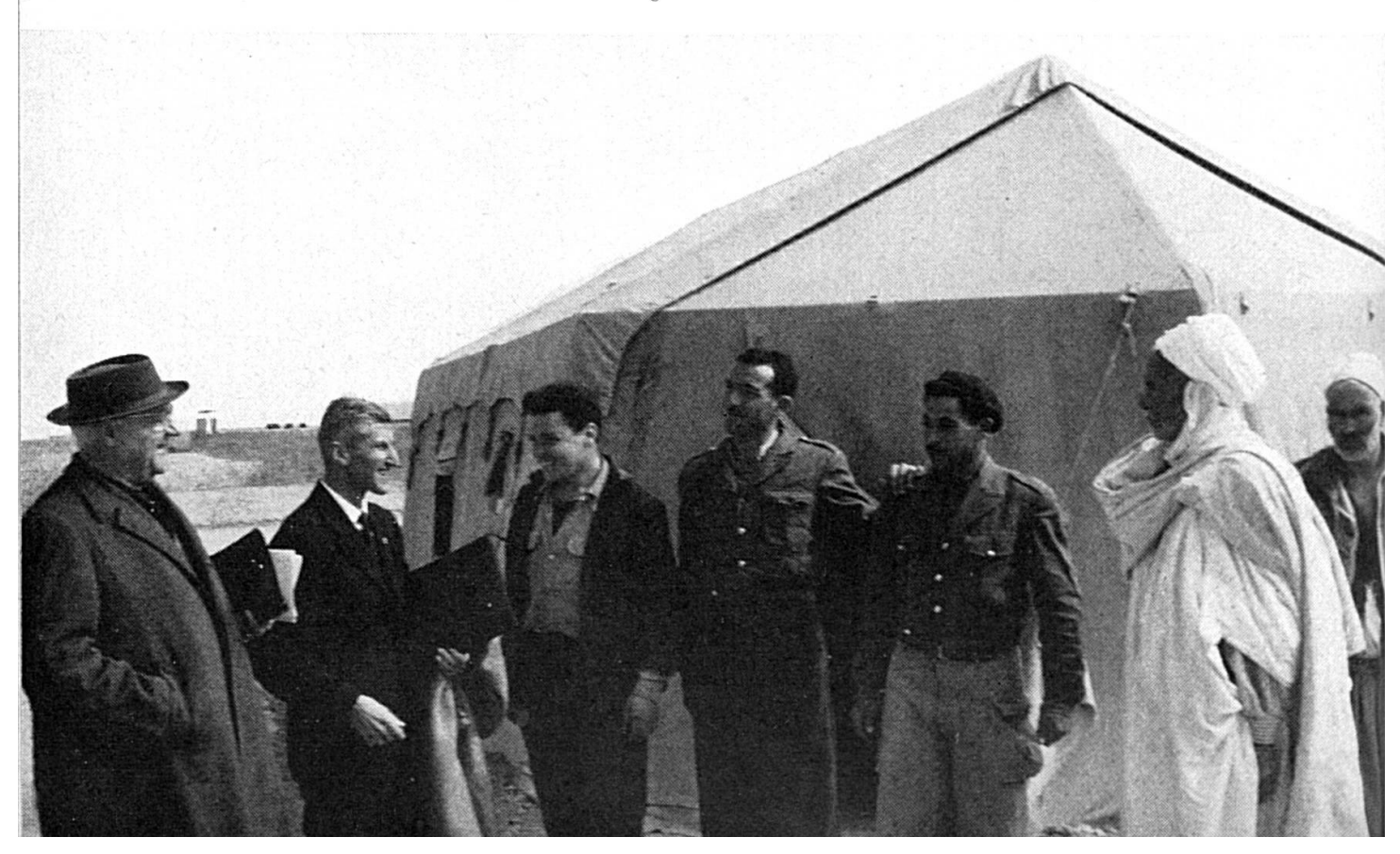
ALGERIA The screening and transit centre in Barika.