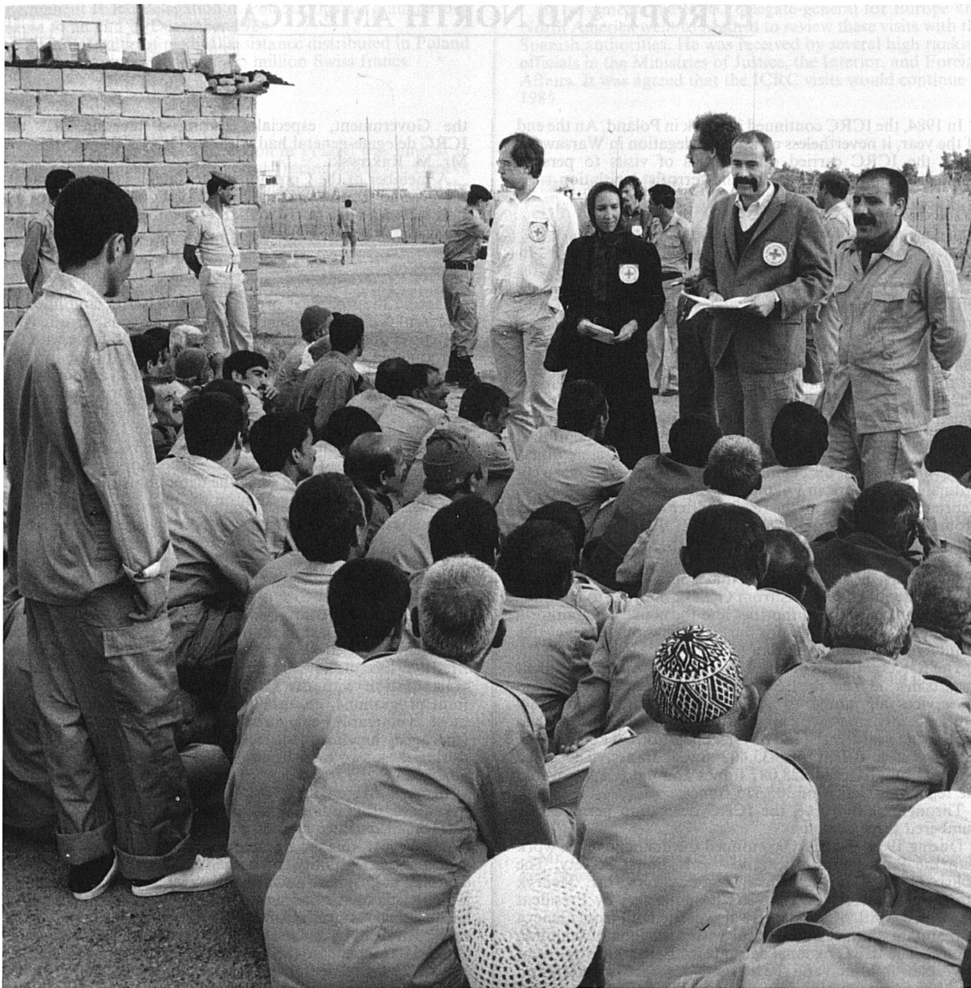
Iraq: Iranian prisoners of war grouped together before being repatriated, via Ankara, under the auspices of the ICRC.