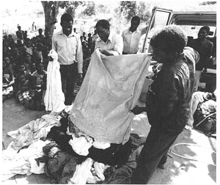
(b, c) Mozambique 1987: distributing clothes and providing medical aid ("Quac-stick").