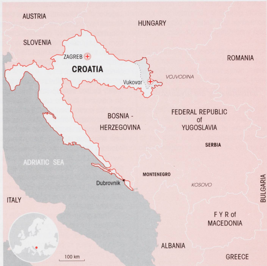
+ ICRC delegation +• ICRC sub-delegation/office ..... Eastern Slavonia, Baranja & Western Sirmium

impediments to the peace and reconstruction process