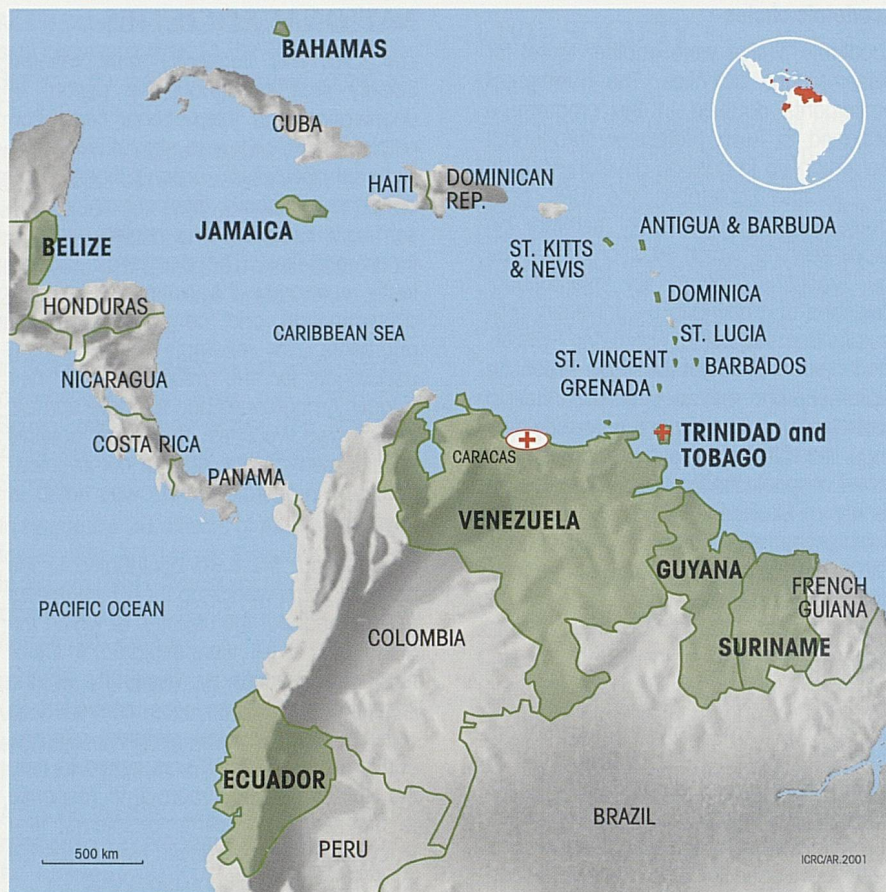
ICRC regional delegation ICRC office

Since July 2001, in addition to Venezuela, Ecuador, Guyana, Suriname, and Belize, the regional delegation in Caracas has covered the 11 English-speaking Caribbean countries. In all the countries covered, the ICRC focuses on spreading awareness of international humanitarian law (IHL) among the armed and security forces as well as civil society. It promotes ratification of the humanitarian treaties and the adoption of national implementation measures. The ICRC also contributes to strengthening the response capacity of National Red Cross Societies throughout the region; particular attention is paid to preparing for the humanitarian needs that might arise in the event of internal strife and tensions resulting from a spill-over of the conflict in Colombia.