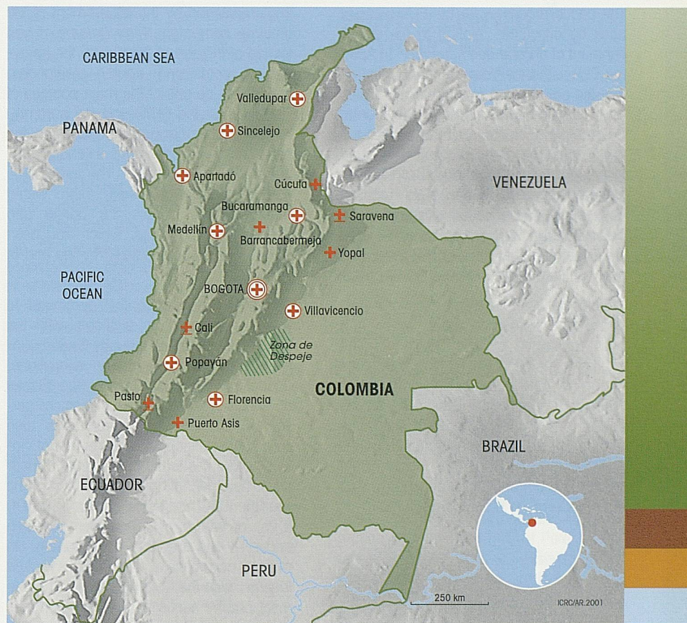
⊕ ICRC delegation ⊕ ICRC sub-delegation ⊕ ICRC office ⊕ ICRC presence