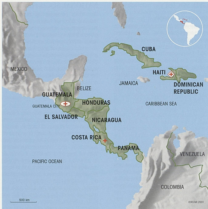
⊕ ICRC regional delegation ⊕ ICRC mission + ICRC office

The ICRC's regional delegation in Guatemala City, its mission in Haiti and its office in San José, Costa Rica, cover a total of nine countries in Central America and the Spanish-speaking Caribbean. They focus mainly on humanitarian diplomacy and the dissemination of international humanitarian law (IHL), although some operational activities continue in Haiti and Panama's Darién province. The ICRC moved the main office of its regional delegation from Guatemala City to Mexico City in July 2001. ICRC activities in the English-speaking Caribbean countries had been transferred to the Caracas regional delegation in March.