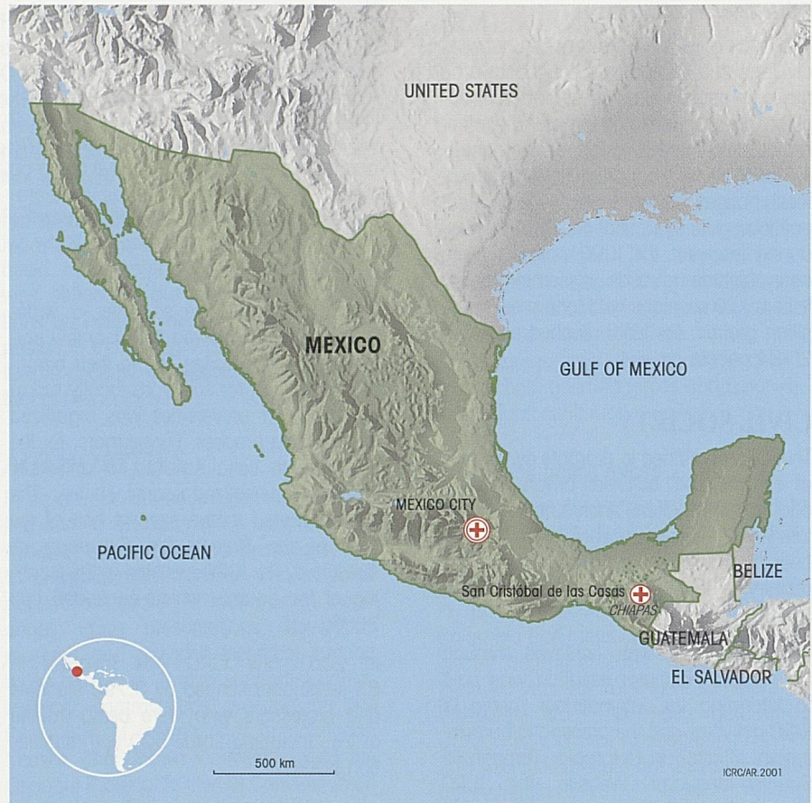
⊕ ICRC delegation ⊕ ICRC sub-delegation

In Mexico the ICRC focuses on providing assistance for internally displaced people and residents affected by the situation in Chiapas and protection for people who have been deprived of their freedom. It also promotes the permanent incorporation of international humanitarian law (IHL) into the teaching programmes of armed and security forces and relevant academic institutions. The ICRC's regional delegation for Central America and part of the Caribbean was moved from Guatemala City to Mexico City in July 2001. Earlier, in March, responsibility for ICRC activities in the English-speaking Caribbean countries had been transferred to the Caracas regional delegation.