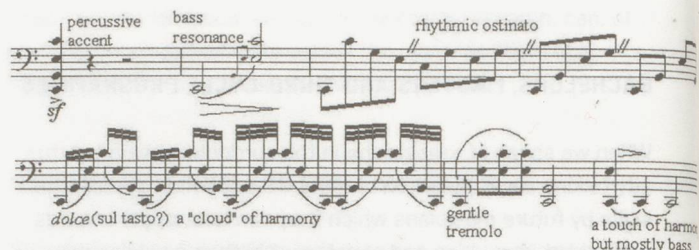
Figure 3 (Smith 2009, 46)

cello in the late seventeenth and early eighteenth centuries, Robert probed ways in which cellists from this period may have added extra notes to a bass line. What was possible, and what would have been desirable in specific contexts?