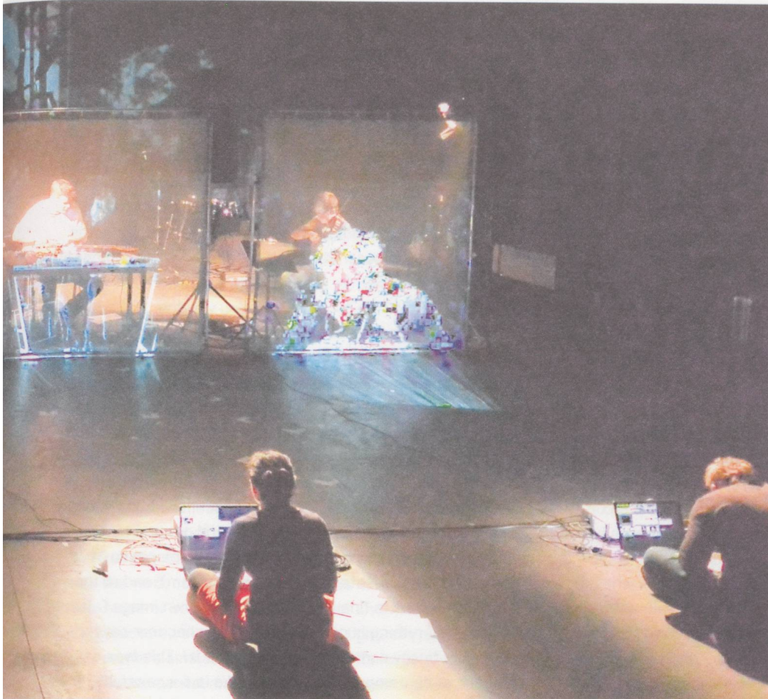
the screens, 4 video-projections.

tary aesthetic problem linked to the issue of the singularity mentioned above: the coexistence in one body of two (or more) completely alien identities. Even in a digitally enhanced body, there will always be something perceived as pertaining to the “self”, something “of its own”: in the same way, even to the most sophisticated computer software the basic, binary language will remain “its own”, fundamentally different from a system of chemical interactions in which the cells of the body communicate. However, in this extended post-human body these morphologically alien elements will be forced to reach some form of unity. In this series of aesthetic studies Prins explores at least three of such basic, internal relations: extension, supplementation and transformation.