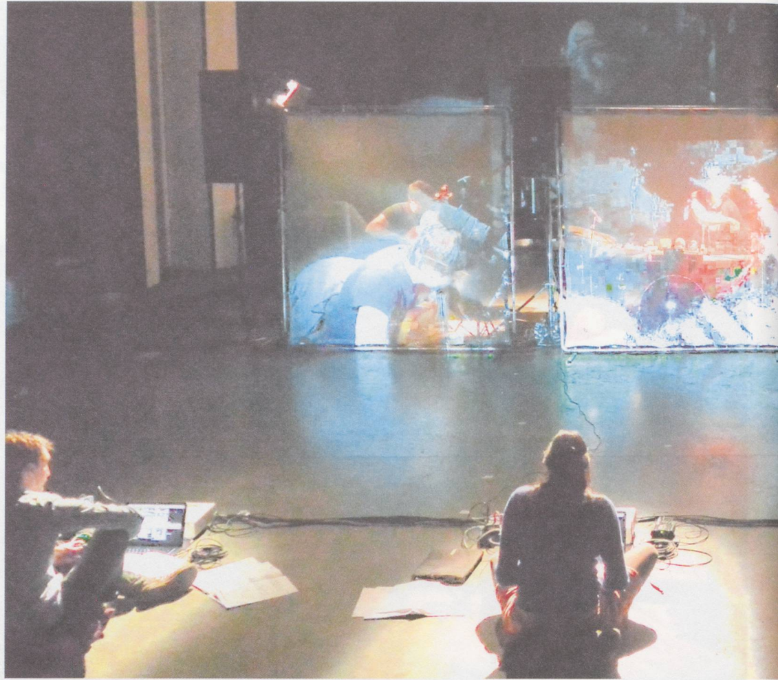
Nadar Ensemble performing "Generation Kill" at Platform Moskou 2013: 4 performers with gamecontroller, 4 musicians behind

At the same time digital capabilities allow for solutions that are much more radical than what was available only a few decades ago to other "gestural deconstructors" like Ferneyhough or Lachenmann.