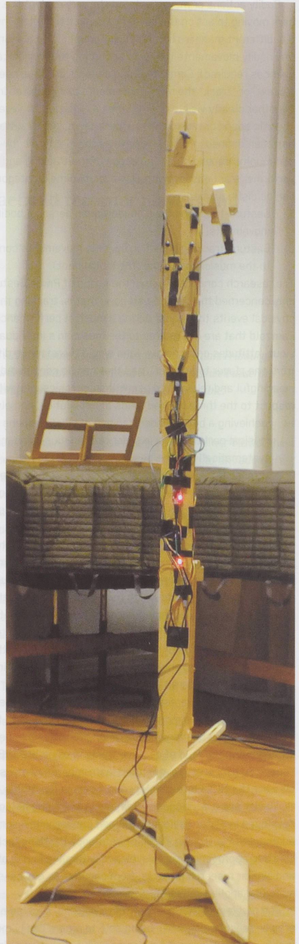
Figure 2: Paetzold recorder fully equipped with sensors.

Thanks to this auto-calibration software, the solution developed (Fig. 2) is easily applicable to any instrument and recorder player. All one has to do is switch on the auto-calibration software and ask the musician to play a scale in which