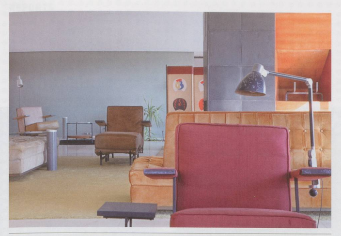
Casa Gomis, main room.

vision as a natural space because of special kinds of natural life. Now with the airplanes flying over, and the chaos and pollution that come with it, who knows what will happen to the natural life? It is something that progresses slowly but will almost certainly effect the vegetation and wildlife there. So there is a line of research that could be undertaken to survey its evolution. But we as a family can do nothing about that. It is for the municipality to be interested and to put forward the propositions to the universities and other relevant hodies.